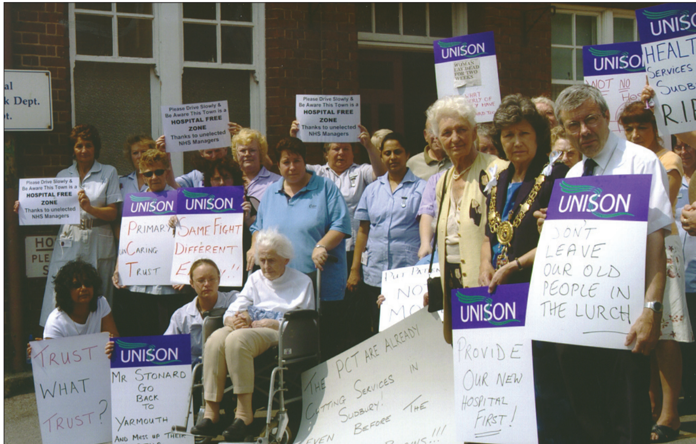
2006: UNISON and local campaigners had to fight a wave of cutbacks and closures across the East of England

Mid Essex PCT, according to its Board paper in March 2009, is looking to a Community Foundation Trust that would work to offer integrated care in