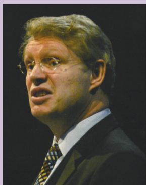
Fatal error: Sir Nigel (now Lord) Crisp was eased out

This time, they are determined to force the changes through with no debate and discussion: that way, they hope, there will be no protest.