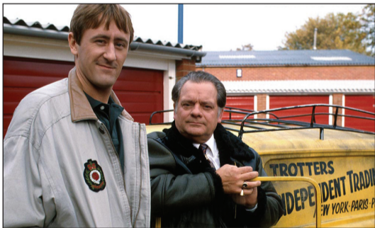
Markets may offer some bargains in fruit and veg, but do we really want the likes of Delboy and Rodney delivering our health care?

In many cases they involve more bureaucracy, new tiers of management, and even the appointment of "commercial directors" – all of which divert resources from patient care.