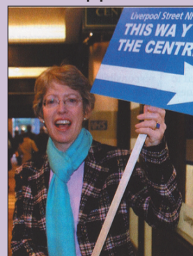
Forced to apologise: Patricia Hewitt

And during 2010 PCTs should develop their implementation plan, watched closely by the SHAs which will be responsible for ensuring that PCTs make "substantial progress".