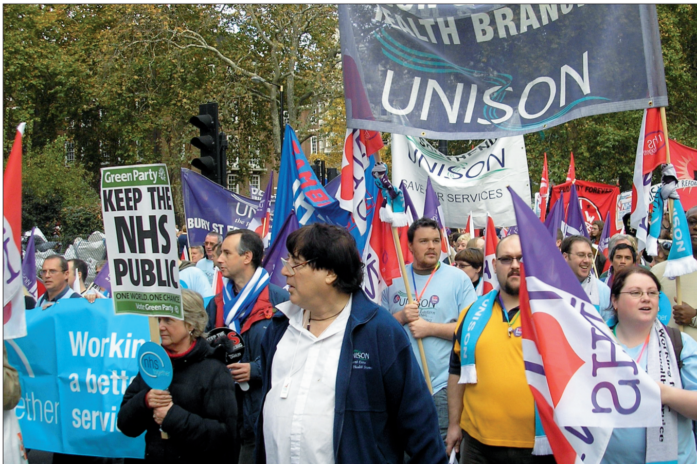
Thousands have marched against privatisation: how many would march in FAVOUR of fragmenting and privatising the NHS?

The reason is obvious: ministers know they would not be able to secure any significant public support for the proposals.